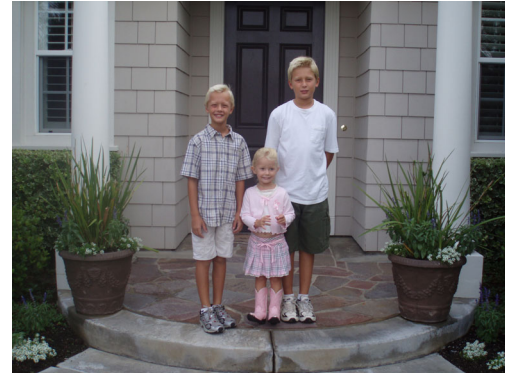
Keep your priorities in focus!